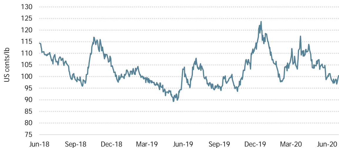
Figure 1: ICO composite indicator daily prices

The ICO composite indicator decreased by 5.2% to an average of 99.05 US cents/lb in June 2020, which is the third consecutive month of decrease. Prices for all Arabica groups trended downward in June 2020, but the Robusta group indicator rose by 0.1% to 64.62 US cents/lb. The volatility of the ICO composite indicator decreased by 1.6 percentage points to 6.1% over the past month. World exports reached 10.49 million bags, 14.6% lower than in May 2019, but this is the third largest volume for May on record. Global shipments in the first eight months of coffee year 2019/20 have fallen by 4.7% to 87.96 million bags. According to recently released data for March 2020, imports by ICO importing Members and the United States increased by 5.1% to 11.76 million bags of which 8.25 million bags originated from exporting countries. In the first half of coffee year 2019/20, imports by ICO importing Members and the United States reached 64.22 million bags, 3.7% lower than in October 2018 to March 2019.